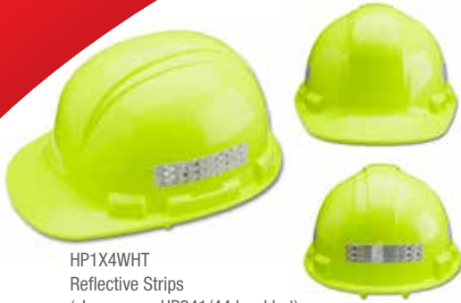
HP1X4WHT Reflective Strips (shown on a HP241/44 hard hat)