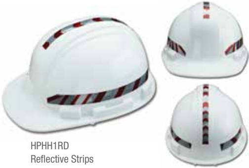
HPHH1RD Reflective Strips (shown on a HP241/01 hard hat)