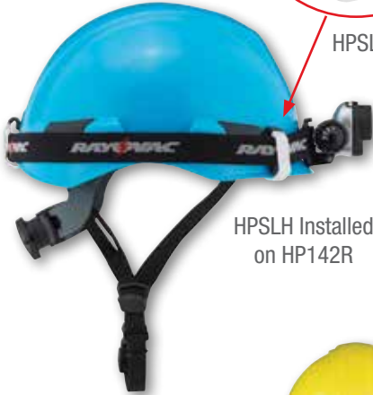
HPSLH Installed on HP142R