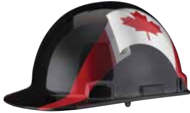
HP341RCAN / HP841RCAN / HP842RCAN

If you want to let others know that you are proud to be Canadian, Quebecois, US citizen or want to hide with a camouflage hat or if you just want to show your true colors; it is possible and you do not have to buy extra quantities as we carry 5 models in stock for now (2 Canadian, 1 US, 1 Quebec, 1 camouflage). We will add more when we see market demand. We can also make personalized full graphic hard hats with your company colors and design in lots of 100 pieces minimum and at a reasonable cost. Let us know what you would like and we will do the artwork and let you approve it. If you are looking for something unique as a gift for your employees or to celebrate a 25th or a 50th year anniversary of the foundation of your company, these hats are the perfect solution.