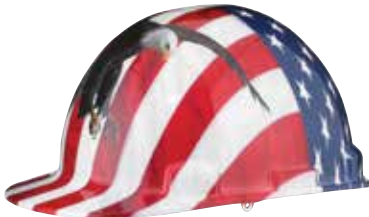
HP341RUSA / HP841RUSA / HP842RUSA