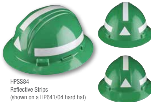
HPSS84 Reflective Strips (shown on a HP641/04 hard hat)