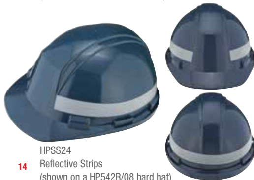
HPSS24 Reflective Strips (shown on a HP542R/08 hard hat)