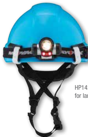
HP142R06 shown with clip for lamp strap HPSLH