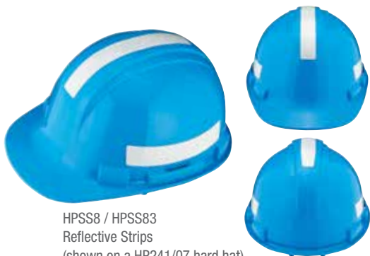
HPSS8 / HPSS83 Reflective Strips (shown on a HP241/07 hard hat)