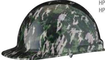
HP341RCAM / HP841RCAM / HP842RCAM