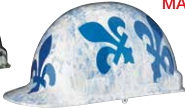
HP341RQUE / HP841RQUE / HP842RQUE